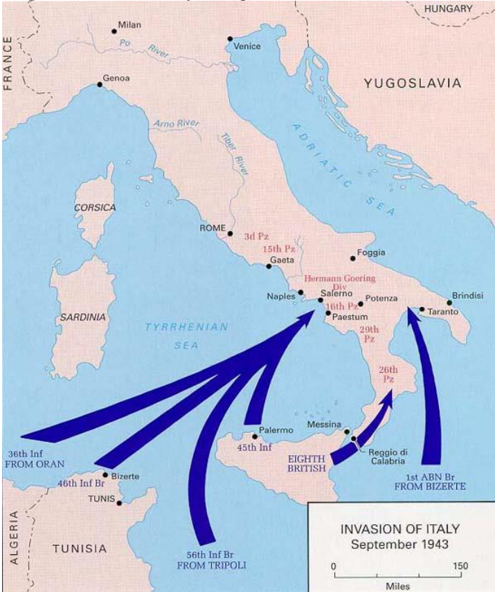
Map 2.1. Inivation of Italy during the WWII (UTL 2016)